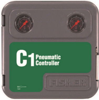
C1 Pneumatic Controller