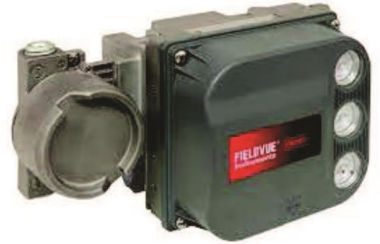
FIELDVUE™ DVC6200 Digital Valve Controller