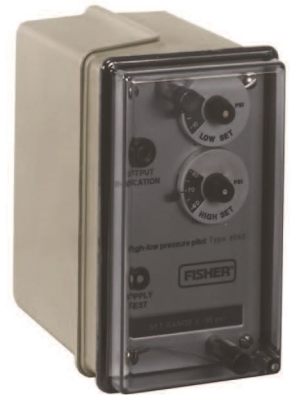
4660 High-Low Pressure Pilot