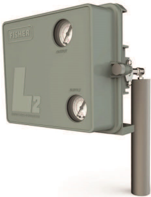
Improved L2 Level Controller