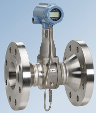
Rosemount™ Vortex Flow Meter

Non-invasive flow meter that can be installed without pipe modification. Suitable for a wide range of applications, including extreme temperatures and low flow rates.