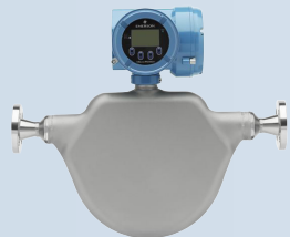
Micro Motion® Coriolis Flow & Density Meter

Often used for steam and non-conductive liquids in harsh environments that require an accurate measurement with a lower pressure drop.