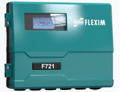
FLEXIM Clamp-On Ultrasonic Flow Meter

4-hole design delivers the accuracy and versatility of a standard orifice plate—without the need for significant straight run.