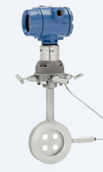
Rosemount™ Conditioning Orifice Plate

Used for applications that require an accurate measurement with a lower pressure drop. Insertion-style mounting simplifies installation.