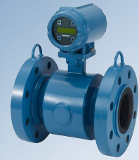
Rosemount™ Magnetic Flow Meter

Primarily used for water applications that require an accurate measurement without a pressure drop.