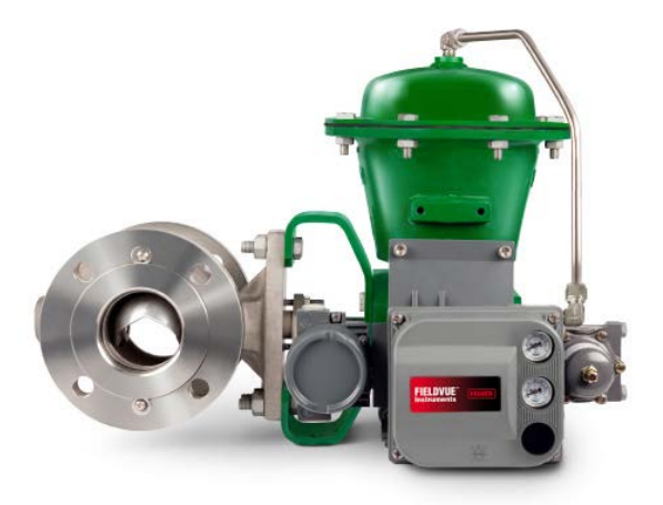
Fisher<sup>™</sup> Vee-Ball<sup>®</sup> Rotary Control Valve with FIELDVUE<sup>™</sup> DVC6200

Using quantifiable data, you can get insights into the performance of your valves and prioritize which need repairs or replacement—and when. This enables you to better allocate resources, extend the life expectancy of your valves, increase the overall reliability of your plant, reduce emissions, and support long-term cost savings. All of these benefits result in an ROI you can get behind.